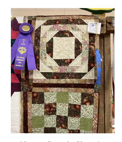
Above: Best in Show!

The Maple Shade Quilters will also be selling fiber merchandise and displaying quilts for your enjoyment!